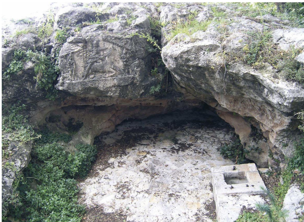
Fig. 5: Močići Mithraeum in Croatia with a relief of Mithra killing a bull (after: Sanader 2008: fig. 14).