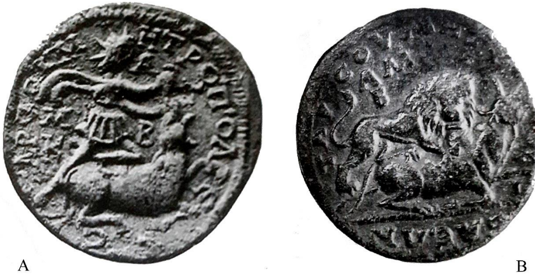
Fig. 4: The reverse of two coins of Gordian III from Tarsus, a) Mithra killing a bull, b) Lion killing a bull (after: Bivar 1998: figs. 15 and 16).

Interestingly, in the Močići Mithraeum in Croatia, a scene carved on the façade of the cave depicts Mithra in human form killing a bull (Sanader 2008: fig.14) (Fig.5). Therefore, this suggests that, in Hulegu Khan’s Cave, the scene of the fight between the lion and the bull also conveys the same thematic message, with Mithra appearing in his animal form, that is, as a lion. Consequently, this relief should also be considered a symbol of Mithra. In a different interpretation, Bivar argues that Mithra should be viewed as a god of death. This might explain his presence in bull-killing scenes, as those found in the Maragheh rock-cut tomb and the Myra cemetery in Turkey.