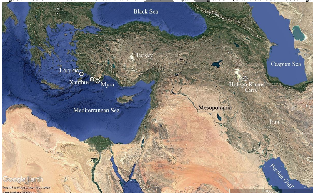
Fig. 6: Map showing the location of rock-cut tombs and stone bases with a symbolic image of Mithra killing the bull (after: Google Earth 10/10/2025, modified by authors).