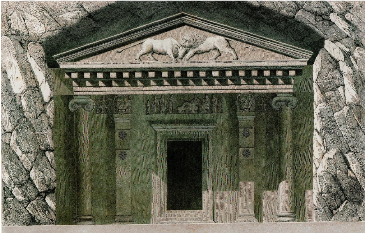
Fig.2: View of the Myra rock-cut tomb in Turkey with a scene of a fight between a lion and a bull (after: Texier 1849: pl. 225).

examples include scenes of lion-bull combat on the Xanthus sarcophagus, the lion tomb at Xanthus, and on a stone base from Loryma, all located in Asia Minor (Nováková, 2014: figs. 8d, 10; Shear, 1914: pl. IV).