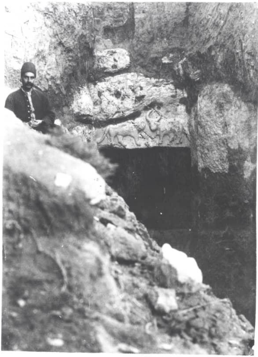
قبر کاوش مرادکن رودخانه جغتو از زلفای پیردشت، دشت دالان اب از دوحه جغتو در ریشی میان و اب کجا حضرت ابراهیم صمدی عظیم اران عمر جا پست