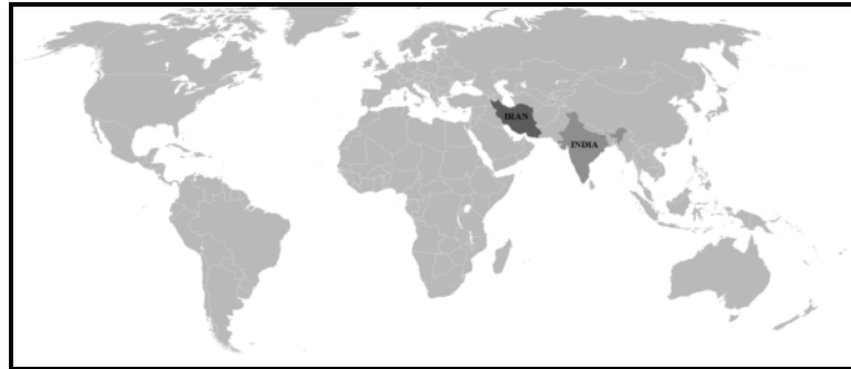
Figure 2. Iran and India's location in the world map

the type of its government is Islamic Republic with one legislature. Persian is the official language of this country and its capital is Tehran. (Research Branch and Cosmography Compilation, 2005: 8), (Figure 2)