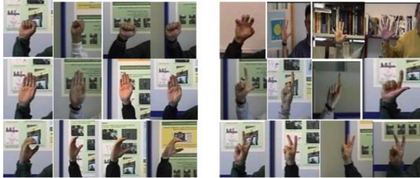
FIGURE 2. Examples of Sign Images Used in IT2FHMM Model Training

Five randomly selected samples per signs are used as the training samples while two of the remaining five samples are referred to as the registered test set ( Reg ), and the rest of the samples are referred to as the unregistered test set ( Unreg ). The recognition rate is calculated as the percentage of the number of correctly classified hand postures to the total number of hand postures [31]. All the experiments are carried out using Matlab R2011a version (7.13.0.564). The proposed algorithms have been implemented on i5-2430M CPU @ 2.40GHz with 4GB RAMs supplied with Microsoft Windows 7 Ultimate operating system.